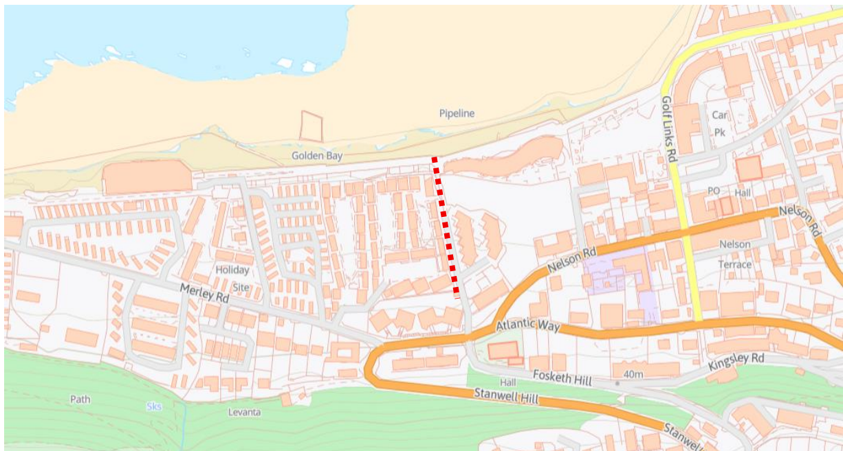
*Location of FP36 marked in red

Further internal discussions are due to take place within the Public Rights of Way team to identify the most suitable approach moving forward, particularly in light of current uncertainties surrounding project costs.