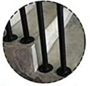
Cement concrete steps

Price: VAT exclusive price not available £76.22£76.22 incl. VAT