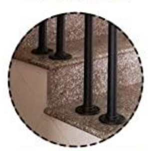
Ceramic tile steps