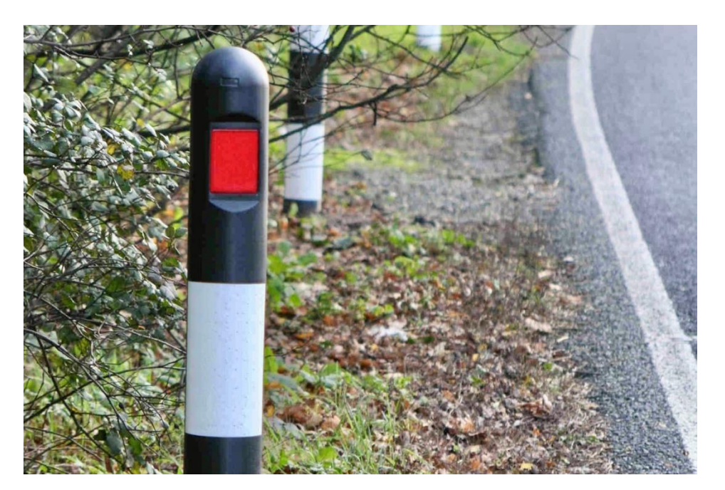
Zebra Hazard Post in Pack of 9 - Tough, Effective & Great Value £ 276.16 <sub>inc.VAT</sub>£ 230.13<sub>exc.</sub>