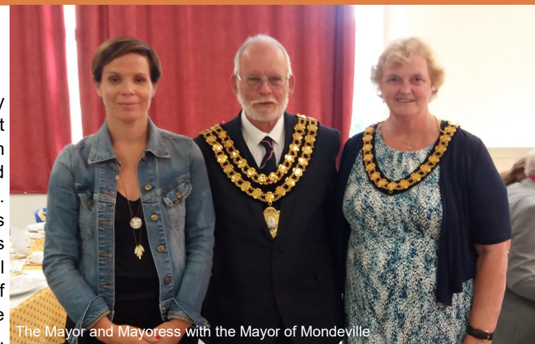
The Mayor and Mayoress with the Mayor of Mondeville

Finally, may I thank all the Councillors and staff who have given me their support and much need advice these last six months